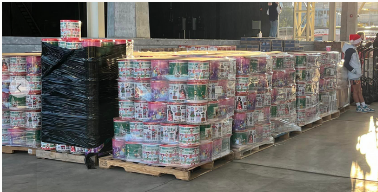
Feast of Our Patron St. Charles Borromeo