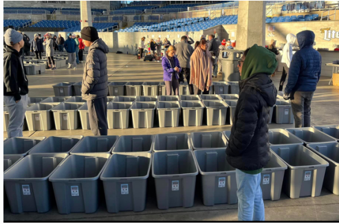
St. Charles Youth Group volunteered at Al's Angel