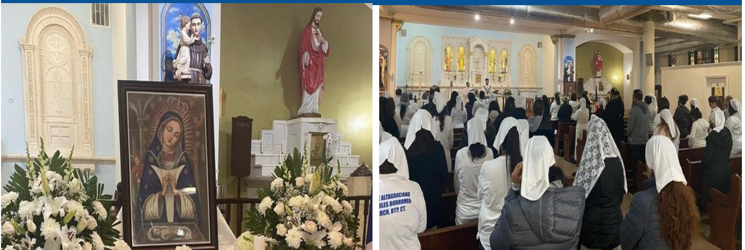
Women of the Rosario & San Jose for the Glory of God and the Sanctification of Souls