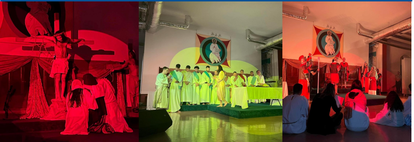
Office of Darkness, Institution of the Eucharist and Washing Feet, Passion of Christ