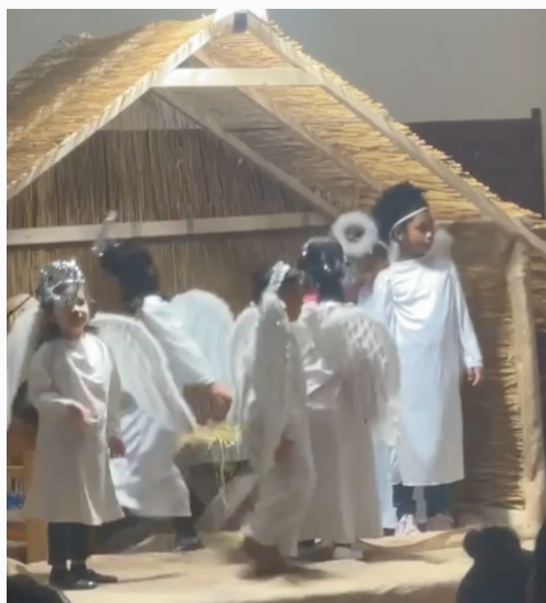
Three Kings Mass Celebration with the children