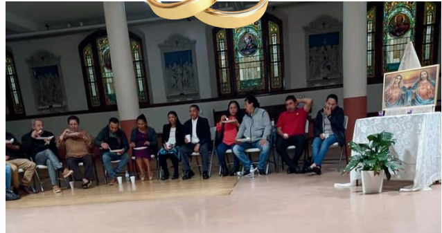
MARRIAGE ENCOUNTER At the Heart of Jesus & Mary