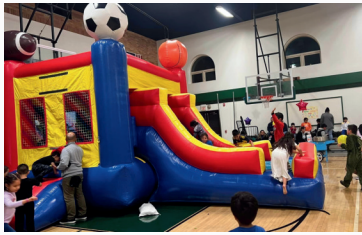
In Honor of All Saints